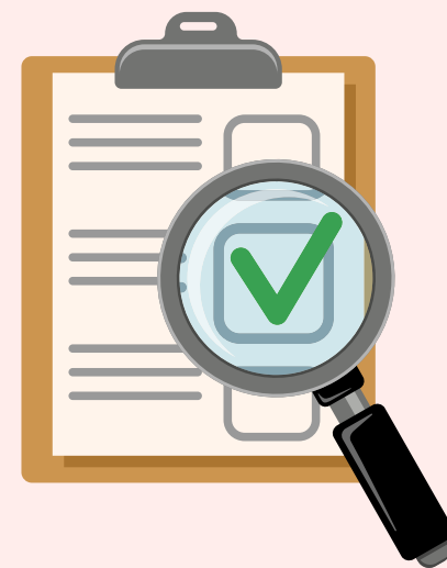
Audits: Hand Hygiene, PPE, reprocessing,