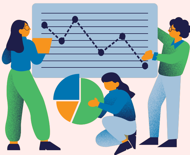
Surveillance: data can identify system level gaps and strengths in infection prevention practices