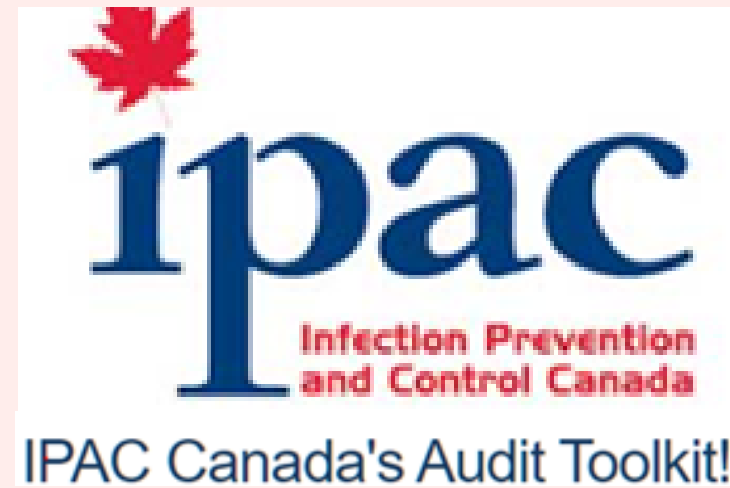
Self appraisal tool