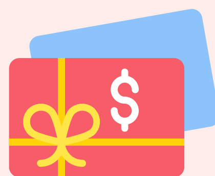
CONTESTS WITH INCENTIVES!