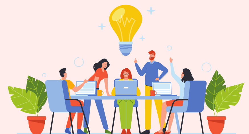
FROM SURVEY RESULTS: WORKING GROUPS