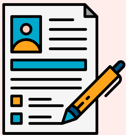
Surveys: needs assessment; client survey, staff surveys

The process involves first establishing who the learners are (i.e. what is their level of training and expertise) and then determining what skills they have, what skills they need and