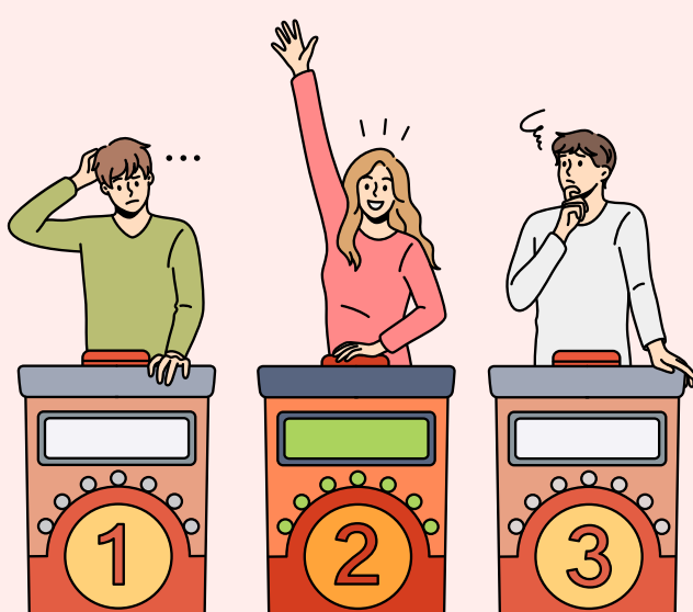
GAMES: IPAC TRIVIA

Choose activities that will communicate knowledge to learners. Training delivery methods keep changing, and you may discover that it’s time to revise your approach to training depending on your audience and your identified gaps.